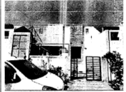
PHOTO OF THE PROPERTY

Canara Bank Mundra, Nemnath Complex, Shop No. 134, New Mundra, Kutch-370421 Phone: 02838-224462/8238091992, E-mail: cb3304@canarabank.com